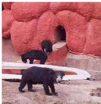
Kakatiya Zoo Park