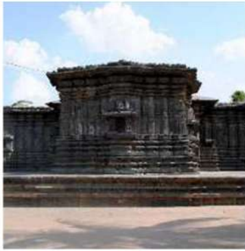
Thousand Pillar Temple