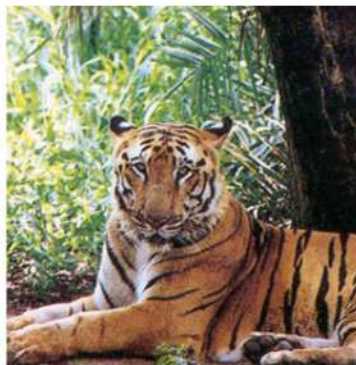
Eturnagaram Wildlife Sanctuary