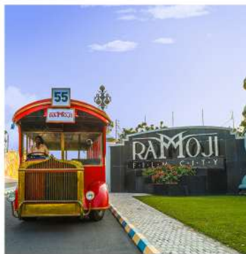
Ramoji Film City