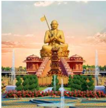
Statue OF Equality