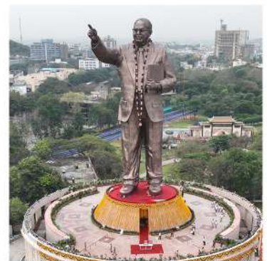
Dr Babasaheb Ambedkar Statue