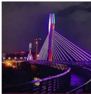
Durgam Cheruvu Cable Bridge