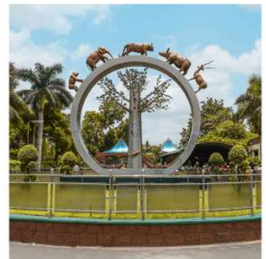
Nehru Zoological Park