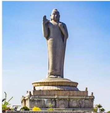
Hussain Sagar Tank Bund