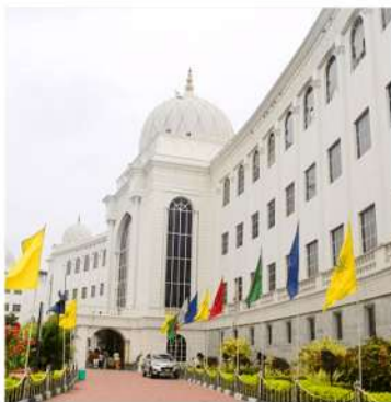
Salar Jung Museum